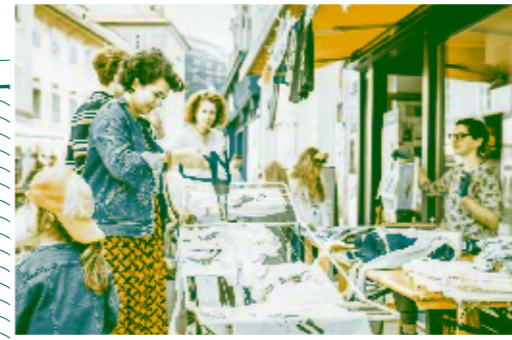
DESIGN YOUR OWN T-SHIRT print workshop before and at tag.werk