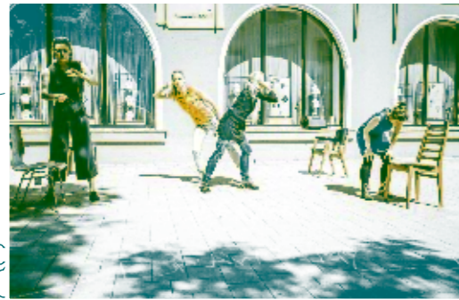
DRAW MY LINE dance theatre performance