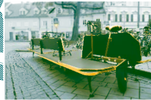
SPACE TRANSFORMER transformation of parking spaces into common areas