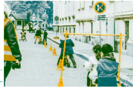
LIVING LAB classroom and playground on the street