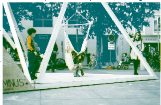
PLUS.MINUS a jointly built wooden structure creates space for everyone

A traffic-calmed street in front of a school not only creates more space for breaks and leisure time, but also allows school lessons to take place outdoors. https://youtu.be/nYU67ukwUQ0